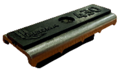
ProLock Dual-Rebate Deck Clip