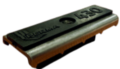
ProLock Dual-Rebate Deck Clip