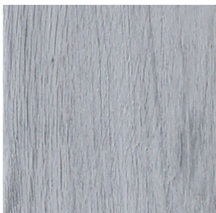
Light French Oak